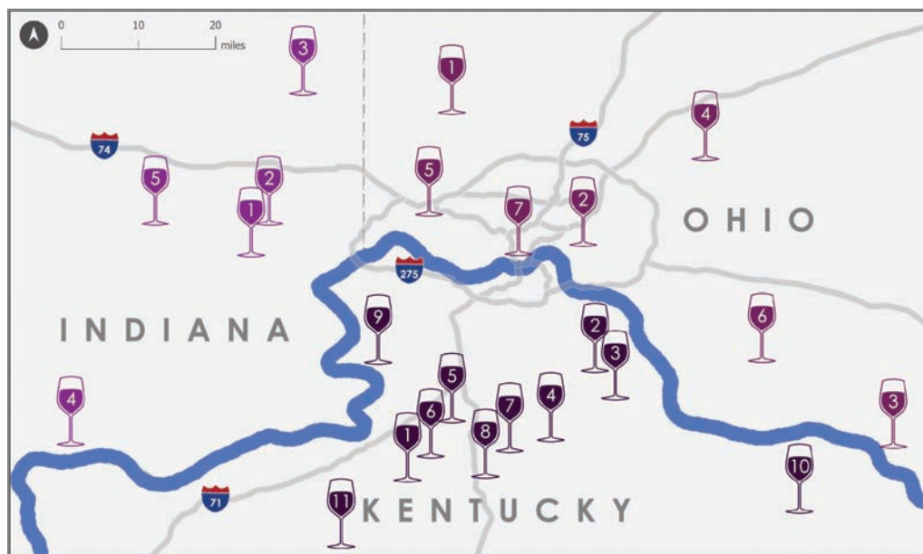
Map by Mel Musie & Alan Wight – Data: Alan Wight