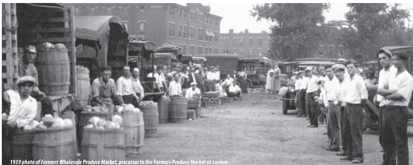
1939 photo of Farmers Wholesale Produce Market, precursor to the Farmers Produce Market at Lunken

I n 1788 the first Euro-Americans settled at Yeatman's Cove, an inlet on the river below today's Broadway St, and the city that would become Cincinnati was born. Within a few years farmers began selling produce at a weekly market above the Cove, and sixteen years later, in 1804, the city built a small market house on the first terrace between Main and Sycamore Streets. Through the 19th century more market houses were built and fed the rapidly expanding city. By the end of the century, however, technological innovations—Incline Planes in the 1870s, electric streetcars in the 1890s, and automobiles and trucks after 1910—opened the uplands and hills to settlements, allowed grocery stores to proliferate, and undermined the viability of the market houses.