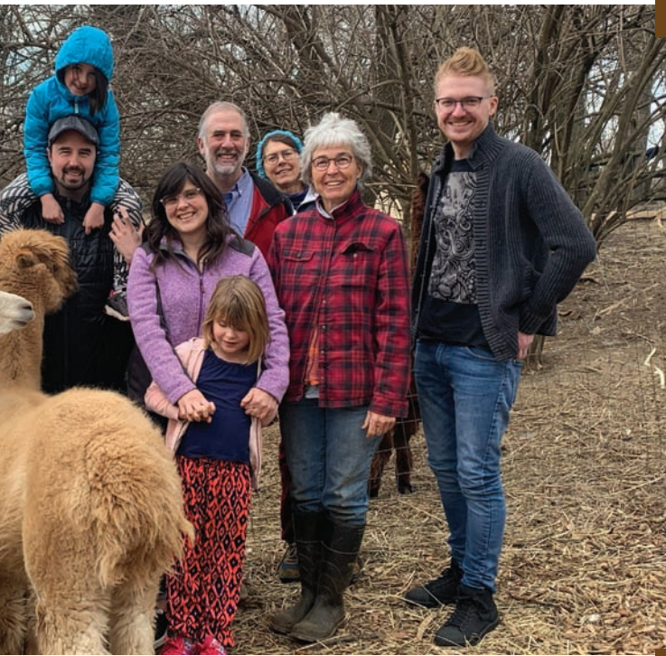
CORV Team at Tikuun Farm